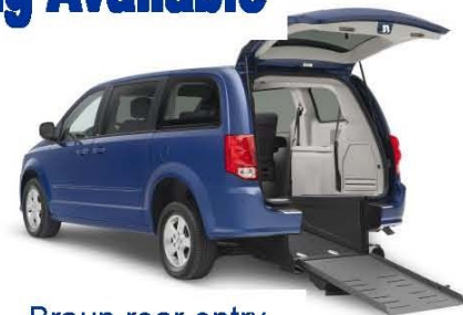
Braun rear entry