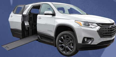
Braun Chevy Traverse