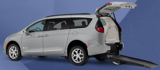
Braun Rear Entry Van