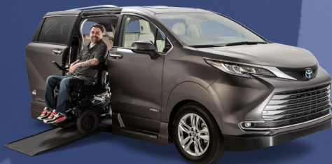
VMI Toyota Sienna