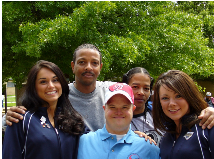
Rams Cheerleaders and some of our guests