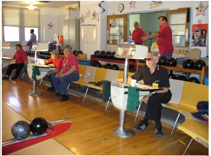
Bowling Alley Volunteers