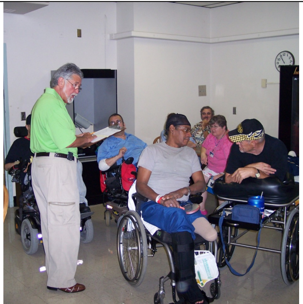
Local Wheel Chair Games