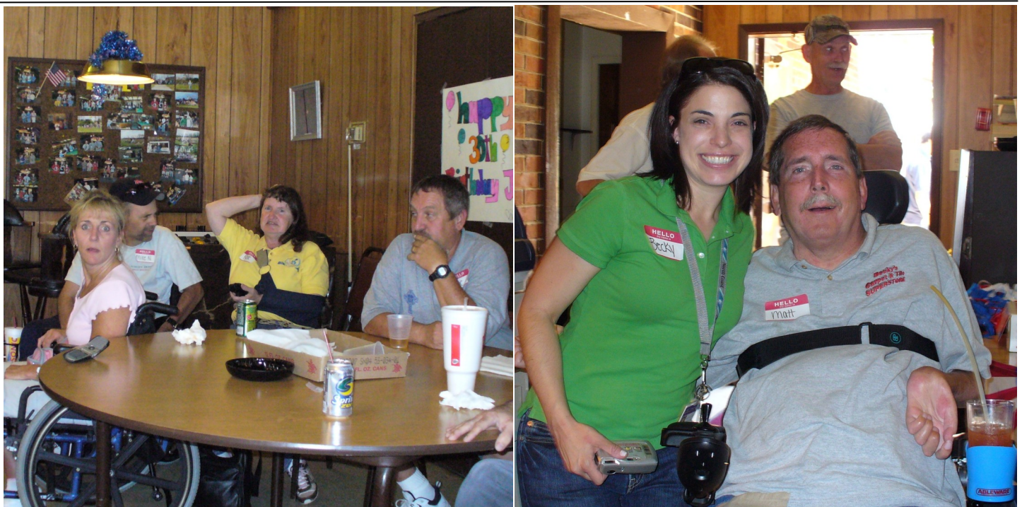
Pictures from the Elks Pool Tournament held May 19 at the High Ridge Elks Lodge.

Name, Return address, Phone number, and Number of tickets required.