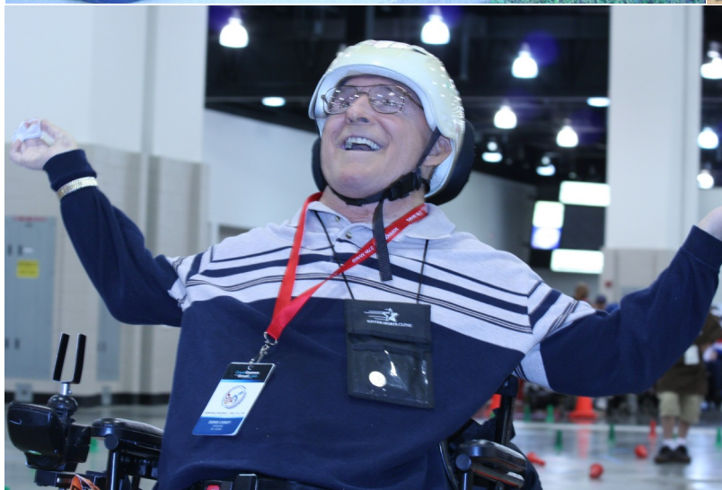
2007 NVWG at Milwaukee