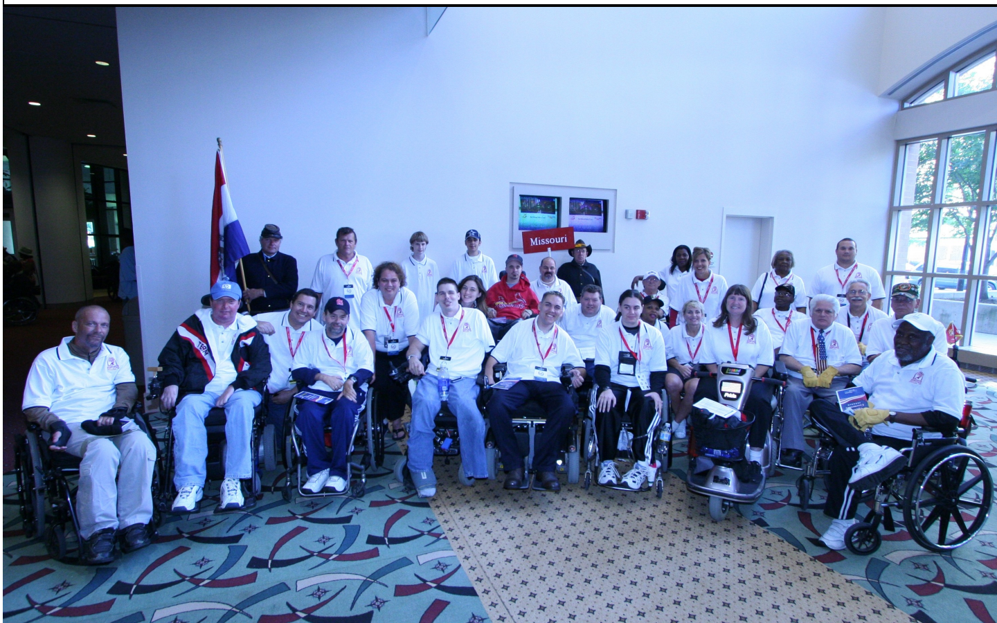
Team photo of the 2007 St. Louis JB/Gateway PVA NVWG taken in Milwaukee Wisconsin

The Official Publication of the Gateway Chapter Paralyzed Veterans of America A Member Chapter of the Paralyzed Veterans of America