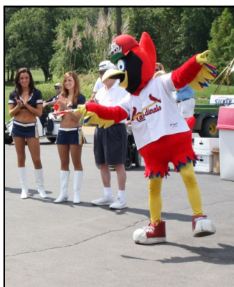
Fredbird® stopped by for a visit, as did the Rams Cheerleaders.