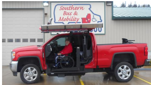
All-Terrain Conversions (ATC)