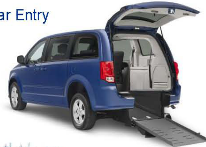
Braun Rear Entry