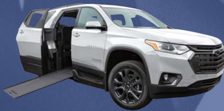
Braun Chevy Traverse