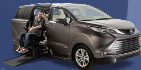
VMI Toyota Sienna