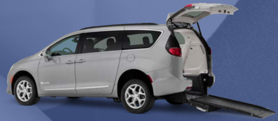
Braun Rear Entry Van