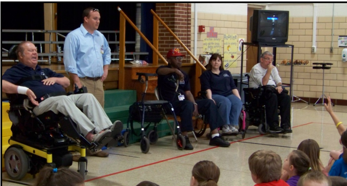
Our chapter visited two schools during PVA Awareness Week in April; Point Elementary left & Cahokia Army JROTC right.