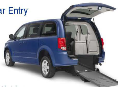
Braun Rear Entry