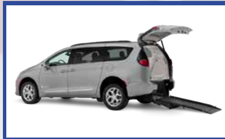
Rear Entry Van