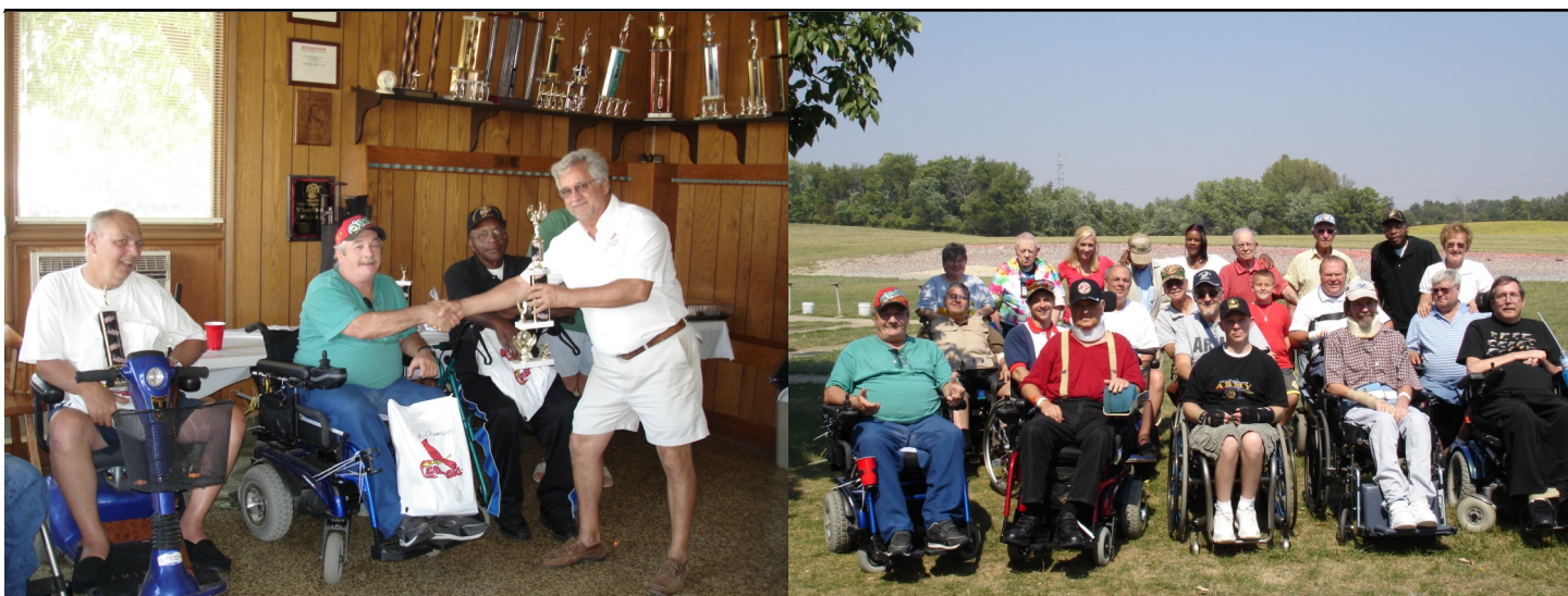
Left, winners of the year end Trap Shoot are presented with awards and right, a group picture from the same event