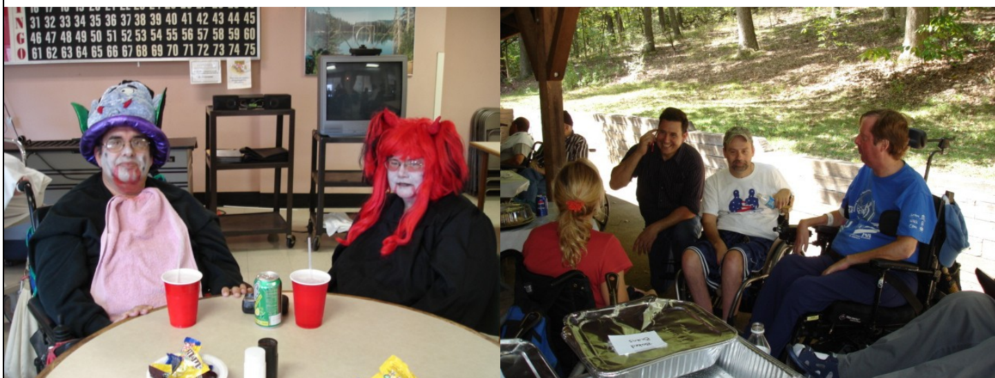
Left, pictures from the annual Halloween luncheon and right, the annual Lone Elk Park event. On the back cover the JB staff are dressed as "Black Eyed Peas".