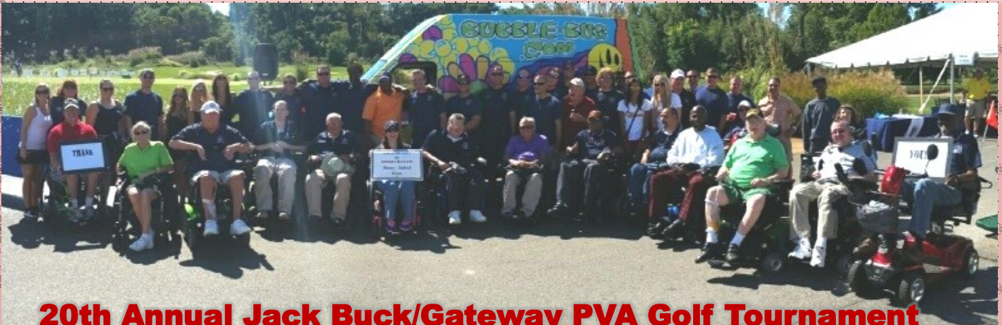
20th Annual Jack Buck/Gateway PVA Golf Tournament