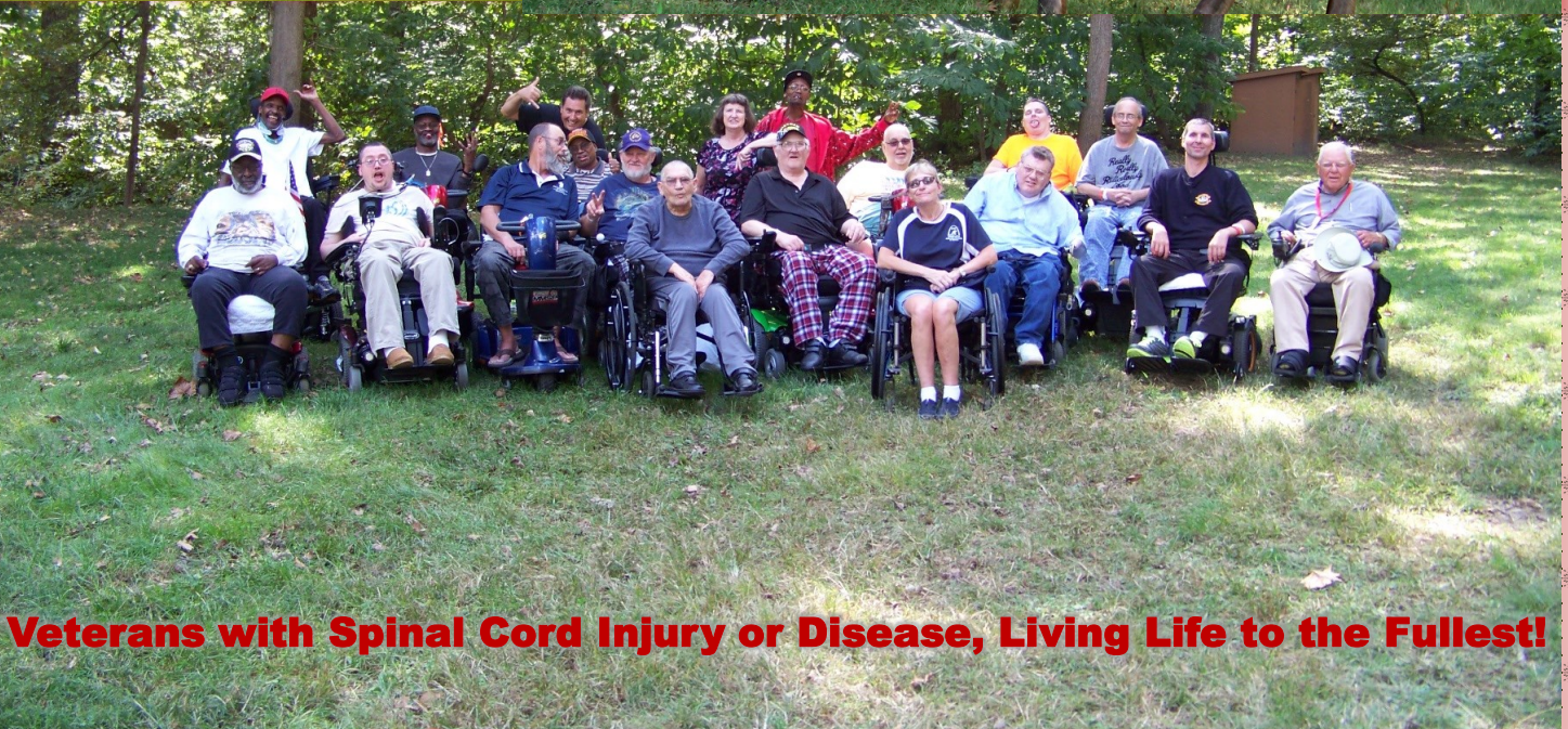
Veterans with Spinal Cord Injury or Disease, Living Life to the Fullest!