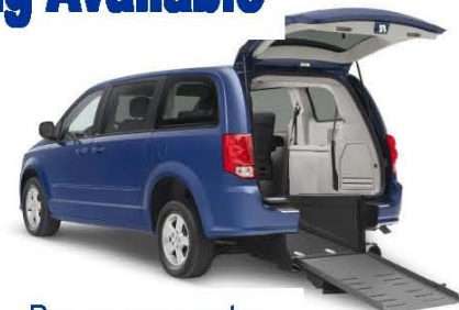
Braun rear entry