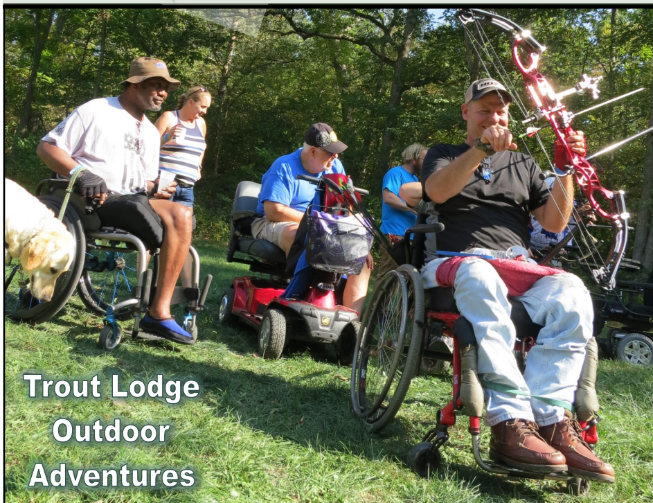
Trout Lodge Outdoor Adventures

Are you aware of the VA Home Modification Grants? Contact us!