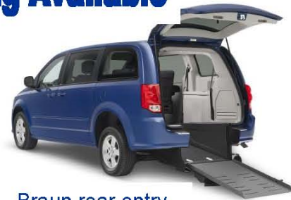
Braun rear entry