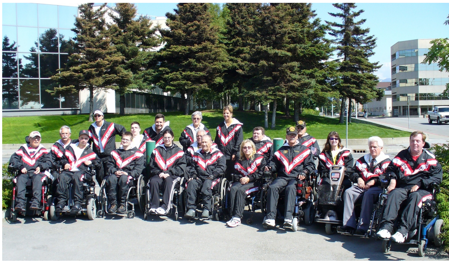
Members of the St. Louis JB VAMC/PVA National Veterans Wheelchair Games Team taken at Anchorage Alaska in July.

The Official Publication of the Gateway Chapter Paralyzed Veterans of America