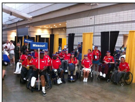
Team St. Louis Gateway PVA