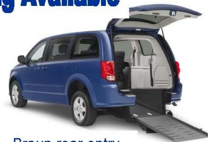
Braun rear entry