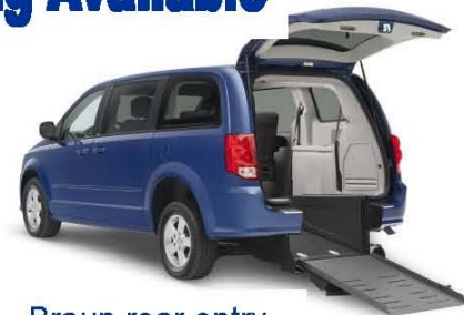
Braun rear entry