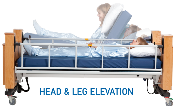
HEAD & LEG ELEVATION