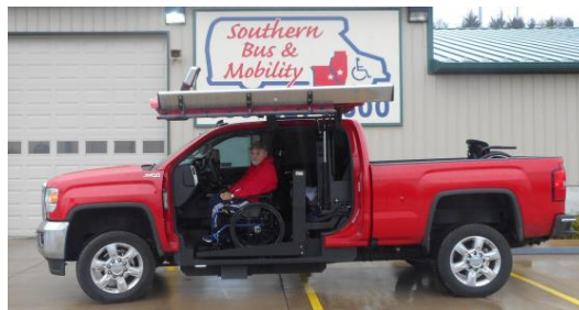
All-Terrain Conversions (ATC)

Authorized BraunAbility, VMI & ATC dealer at both locations