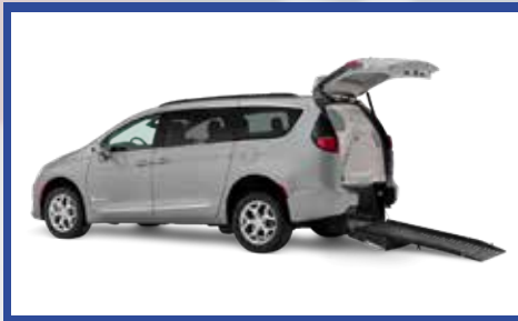
Rear Entry Van