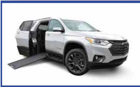
Braun Chevy Traverse